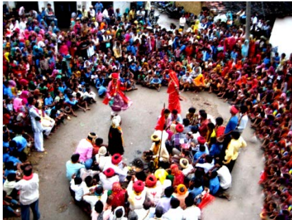
Gavari troupe on daily inter-village pilgrimage