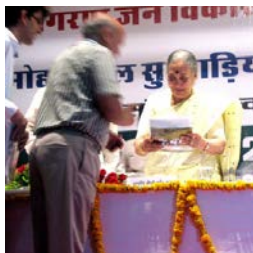
To Gov. Margaret Alva,