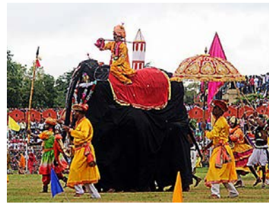
Final procession re-enactment