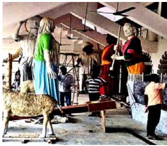
Gavari diorama figures