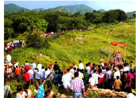
Typical village gathering of participants

The Gavari Project is a 5-year multifaceted effort we began in 2014 to introduce Gavari’s profound messages & artistry to India and the world to safeguard their survival and renew their vitality.