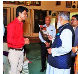
Sri-ji Arvind Singh Mewar