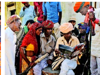
Gavari artists & Bhil elders